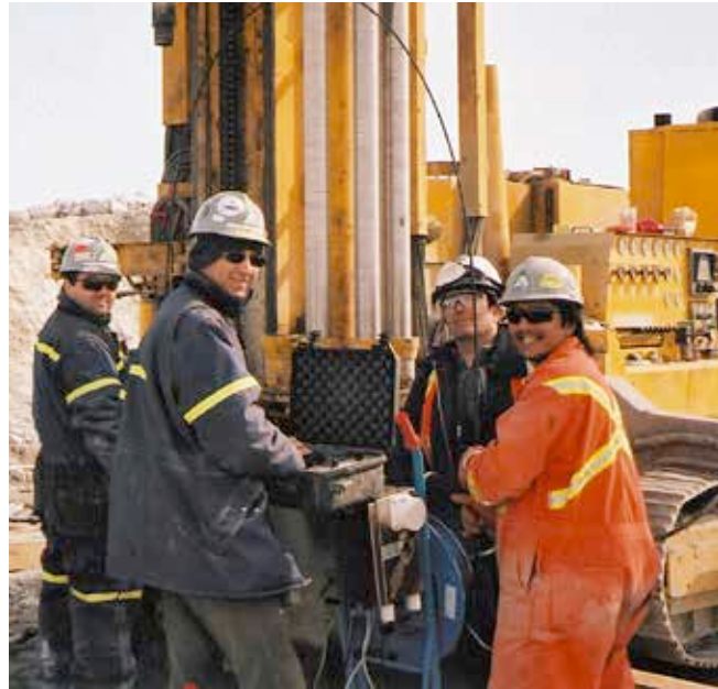
Fig. 5. P 401 inclinometer.