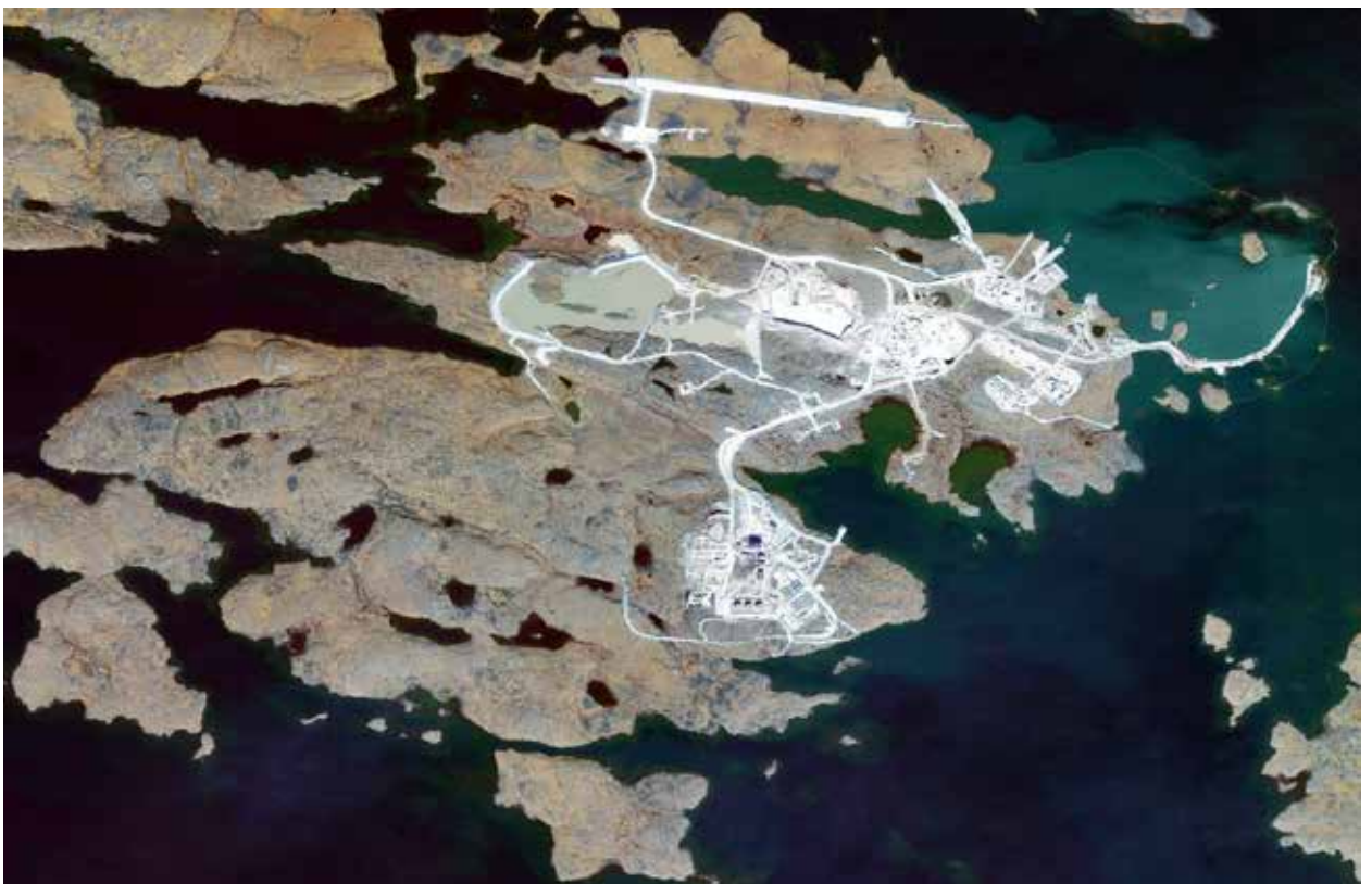
Fig. 2. Aerial view of the zone of the future mine.