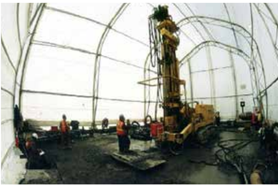
Fig. 6. Mobile shed for protection of the equipment and view of the machines at work inside the shed.