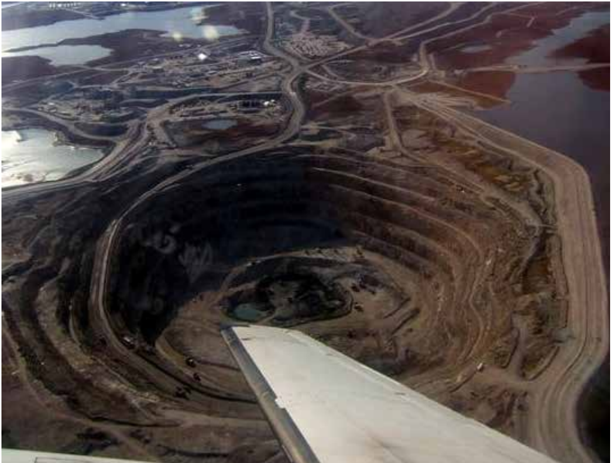
Fig.12. Open-air mine at work.