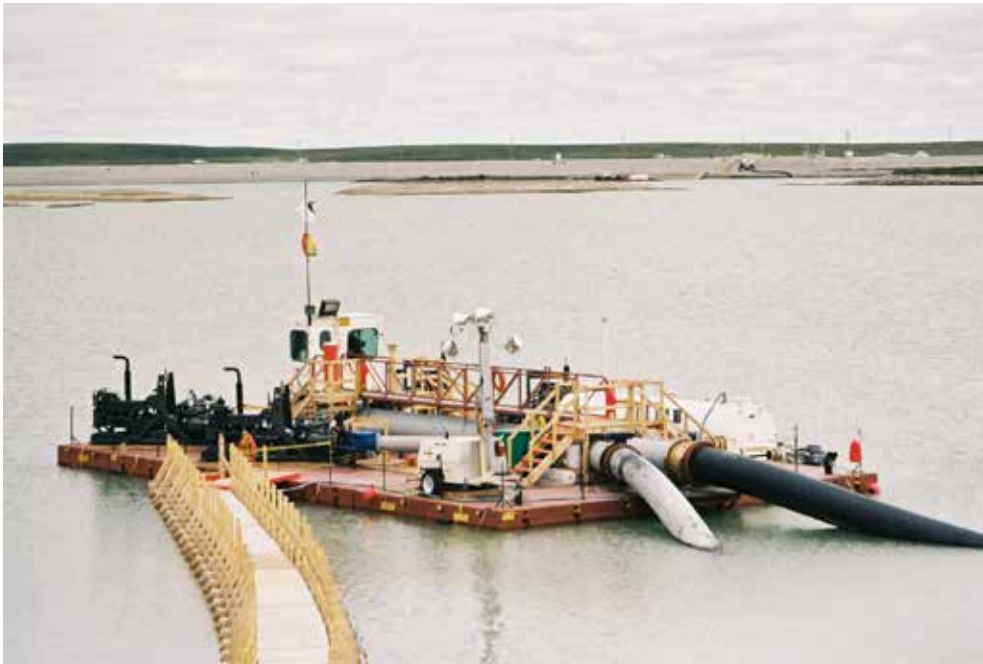
Fig.11. Various stages of draining the lake.

Considering the extreme weather conditions, the work was performed using different methods at different times of the year: during the winter (November to May) the equipment had to work in heated environments of different types depending on the job to be done. The drilling machines were protected by mobile sheds while the mixing and pumping ma-