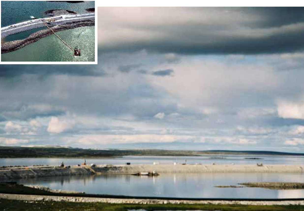
Fig. 3. Views of the stone dam.

During the construction of the waterproof plastic diaphragm problems of the geological and technical nature arose, so that in most cases it did not reach the depth foreseen;