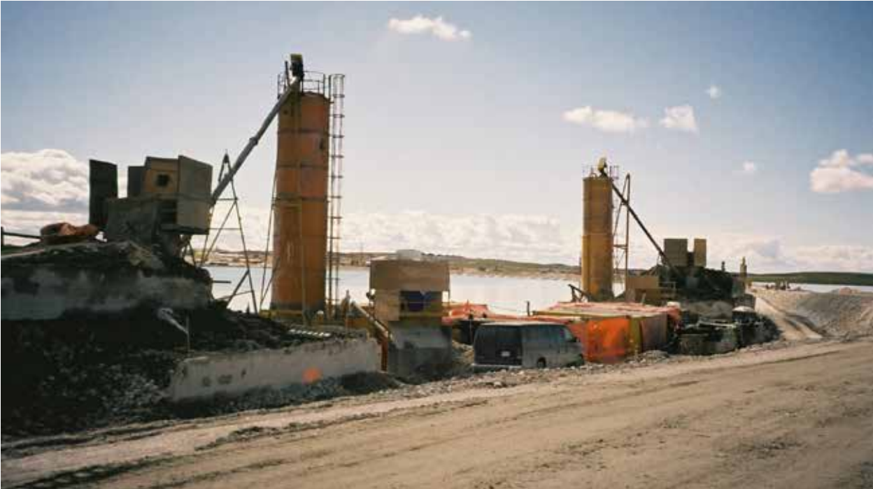
Fig. 9. Pacchiosi mixing installation outdoors.

Lo schermo realizzato doveva garantire una permeabilità inferiore a 1 \times 10^{-6} cm/sec nell'80% dei casi, e comunque sempre superiore a 1 \times 10^{-5} cm/sec ed una resistenza alla compressione semplice a 28 giorni di maturazione compresa tra 0,8 e 2 Mpa.