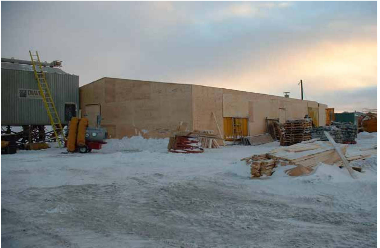
Fig. 7. View of the shed structure used to protect the mixing and pumping equipment.

Al termine di ogni perforazione è stata eseguita la misura di verticalità su tutta la lunghezza del foro con l' Inclinometro Pacchiosi modello P401 . (Fig. 5)