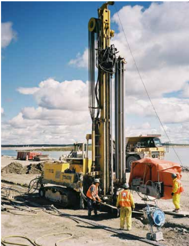
Fig. 10 . Pacchiosi P 1500 ESCR drill rig.

Lo schermo realizzato doveva garantire una permeabilità inferiore a 1 \times 10^{-6} cm/sec nell'80% dei casi, e comunque sempre superiore a 1 \times 10^{-5} cm/sec ed una resistenza alla compressione semplice a 28 giorni di maturazione compresa tra 0,8 e 2 Mpa.