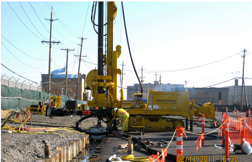
Fig. 1. P1500ECS drill rig positioning