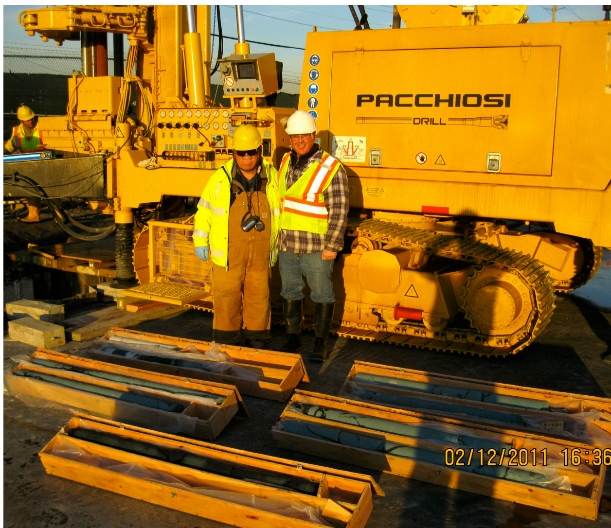
Fig. 9. Photographs of cored samples