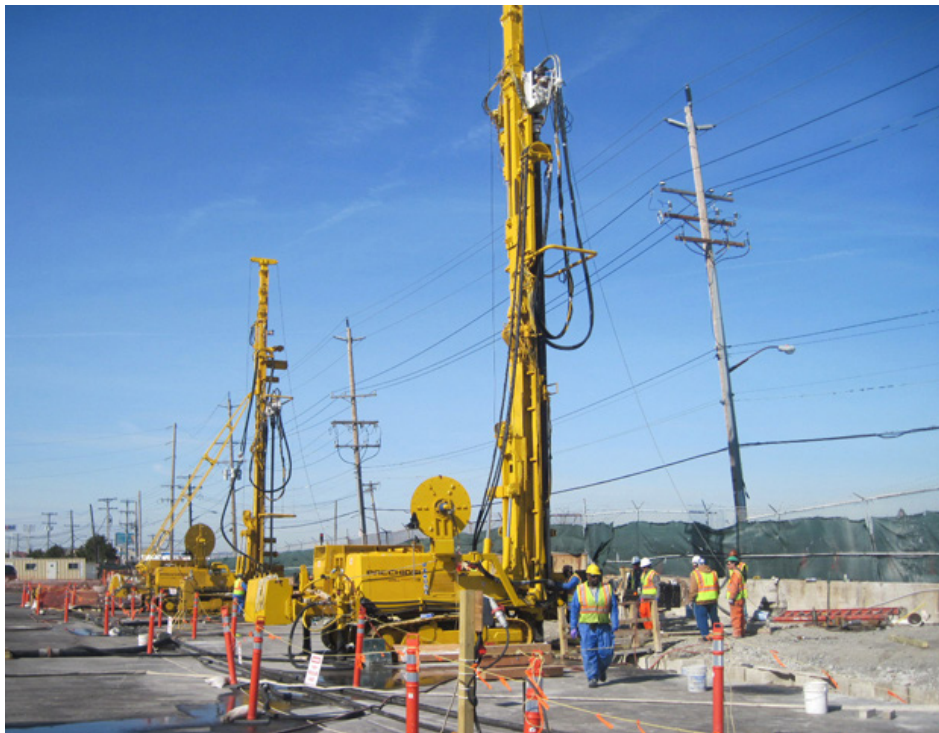
Fig. 5. PACCHIOSI P1500ECS drill rigs operating with automatic rod loader