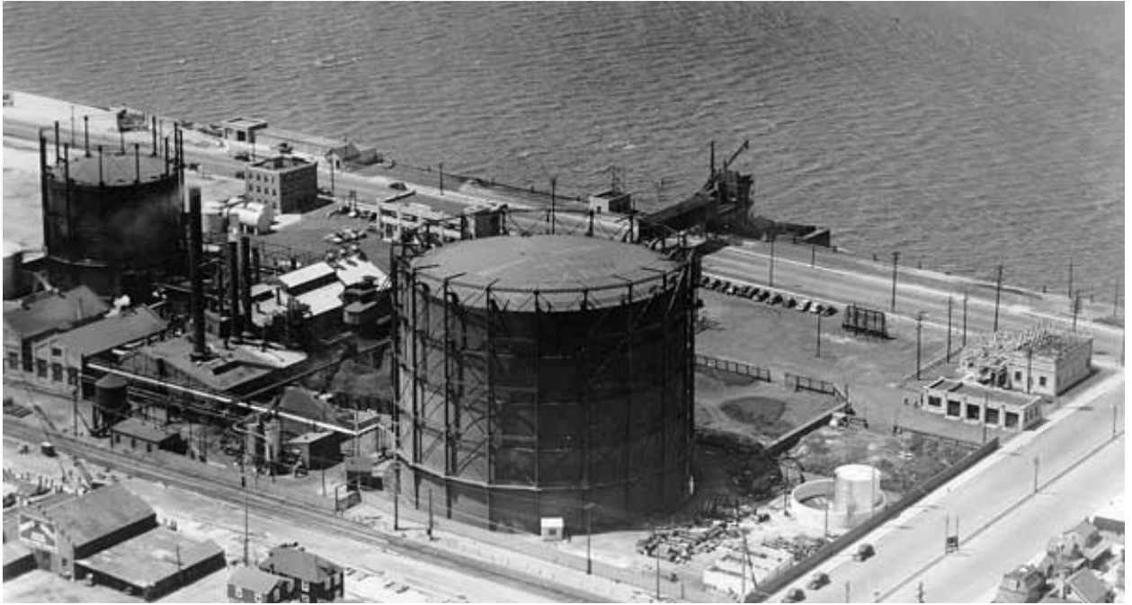
Fig. 2. View of Rockaway Park MGP plant before disposal (1950)

As a result of this classification, KeySpan, in agreement with the NYSDEC (N.Y. STATE DEPARTMENT OF ENVIRONMENTAL CONSERVATION), in 1999, carried out a feasibility study on the recovery and remediation of the site.