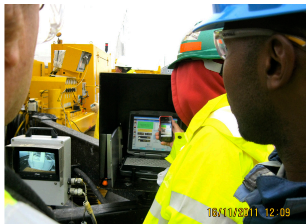
Fig. 7 e 8. Measuring of the deviation of drilled hole before injection