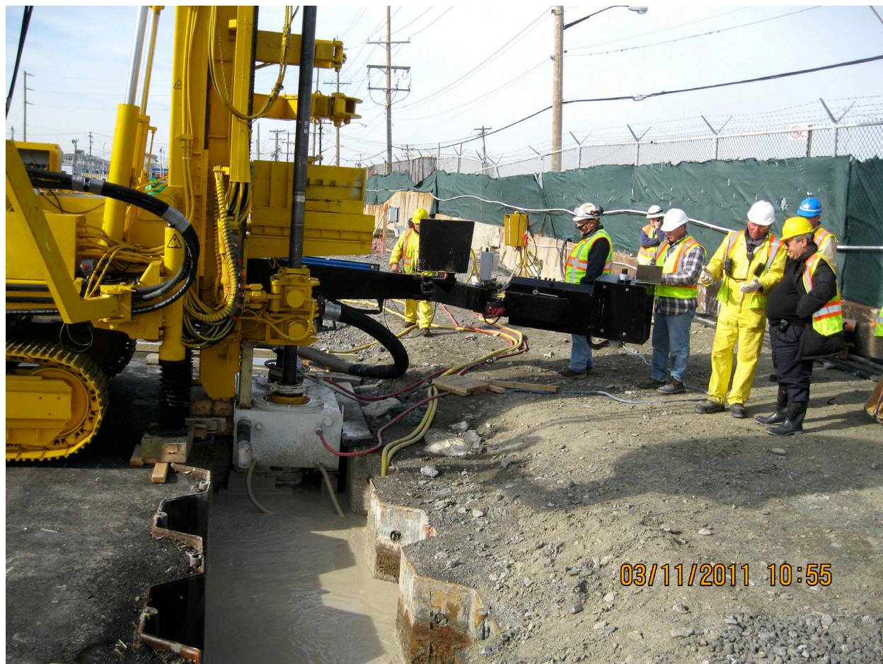
Fig. 6. Special watertight tank used for Jet Grouting spoils' collection