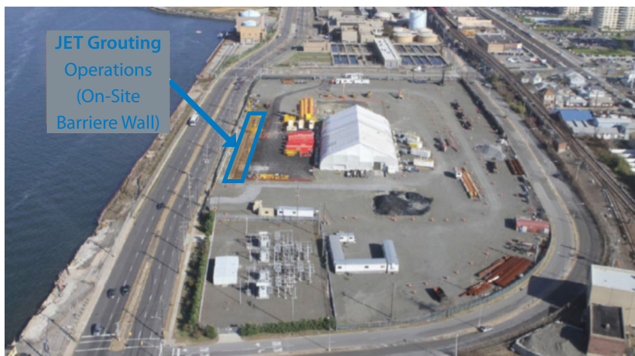
Fig. 3. View of Rockaway Park MGP area during works