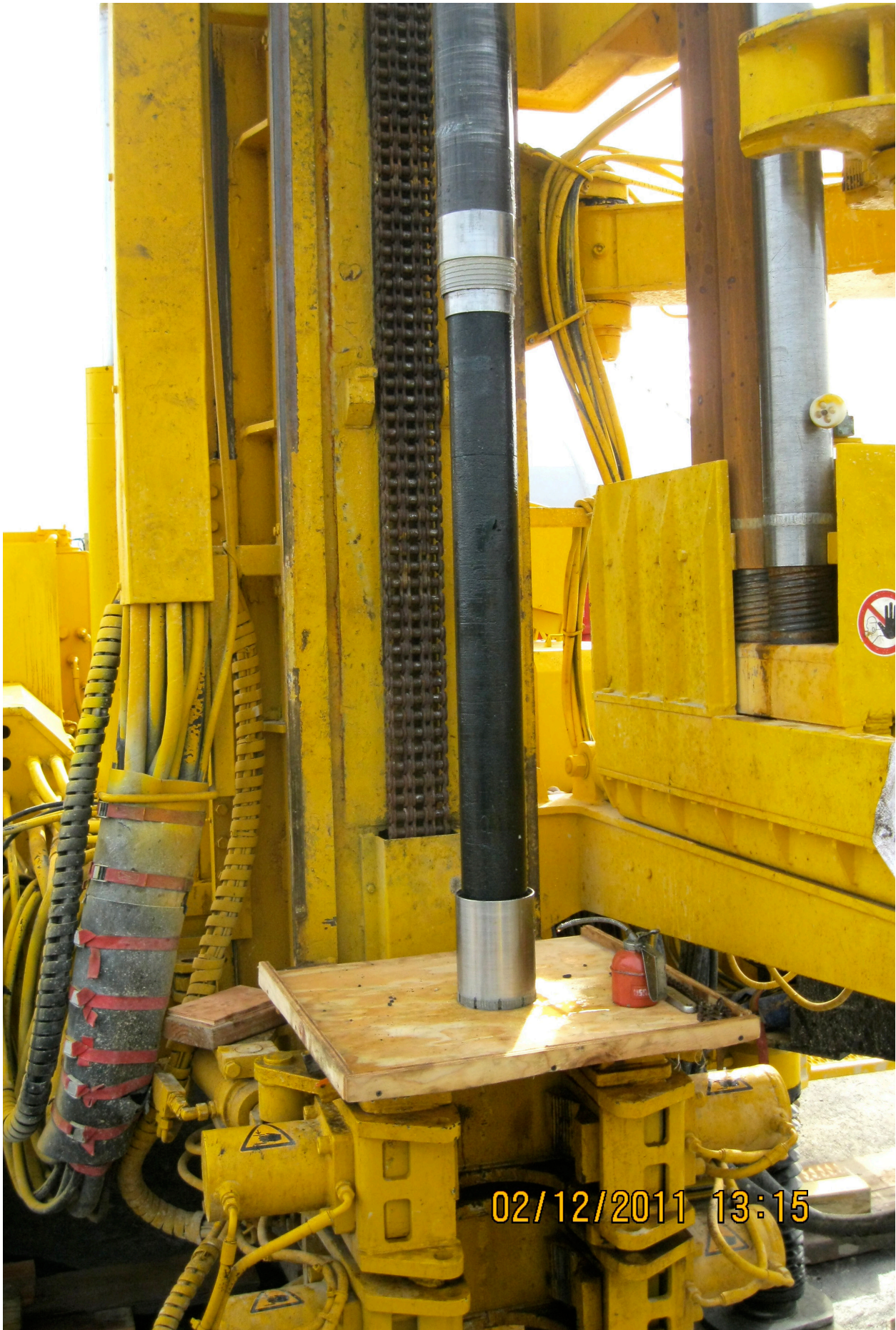
Fig. 10. Extraction of a perfect cored sample