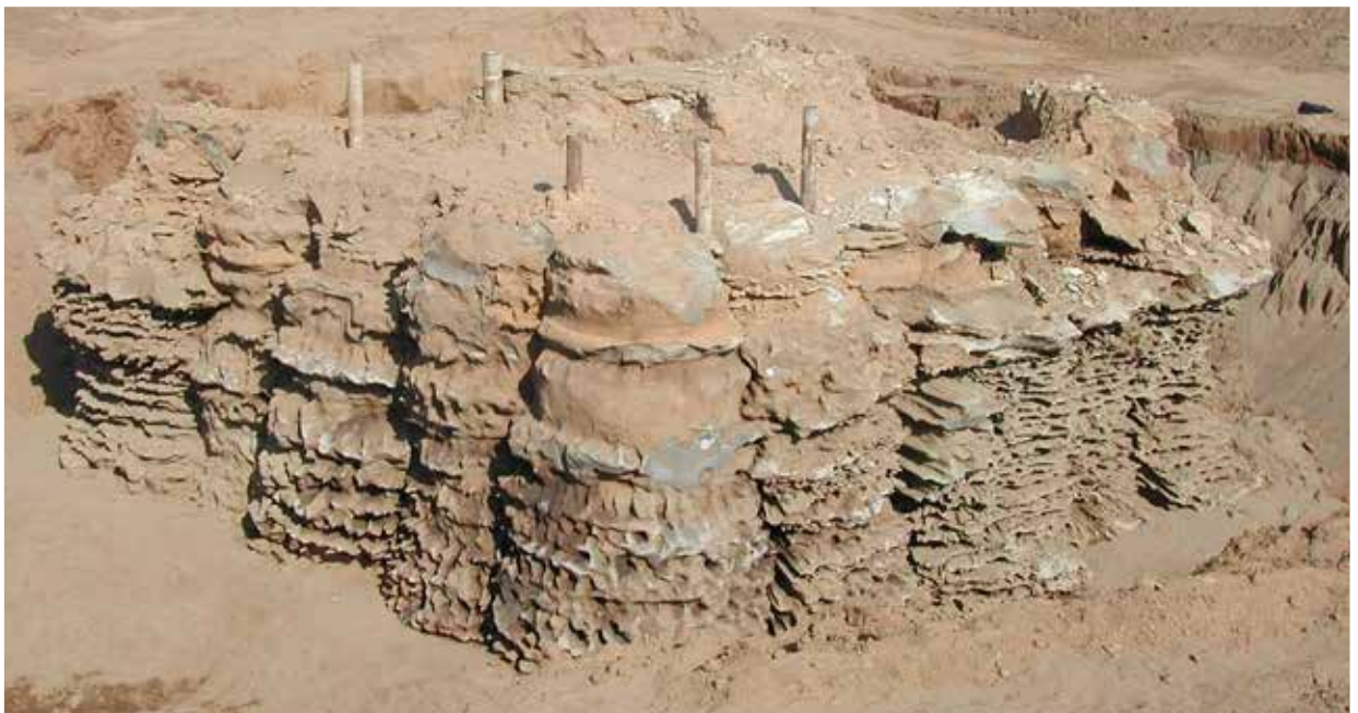
Fig. 3 - 4. Columns produced in the field tests.