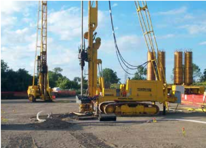
P1500 ES drill rig in action.