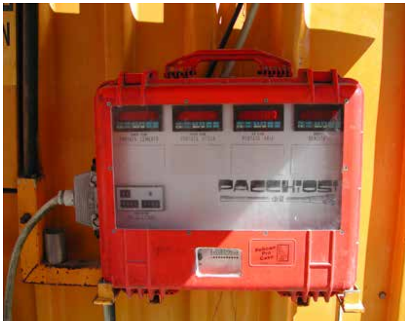
Fig. 2 System of data acquisition and registration with PRS3.