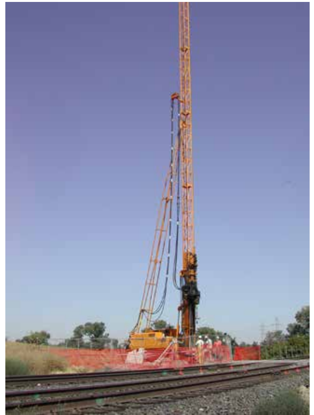
Fig. 9 P 1500 ES drill rig in action along the rail line.

They were all installed in the same plane, perpendicular to the rail line.