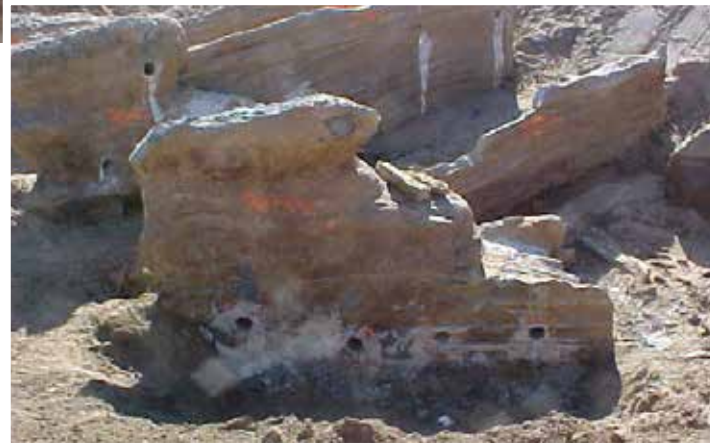
Fig. 5 – 8 Panels facing one way produced in the field tests.